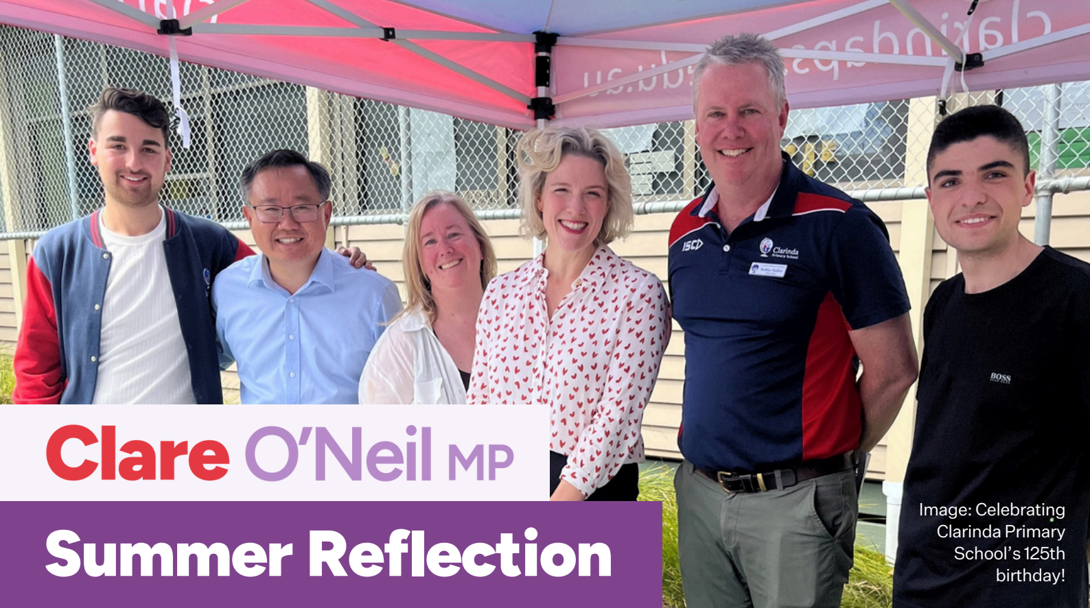
Image: Celebrating Clarinda Primary School's 125th birthday!